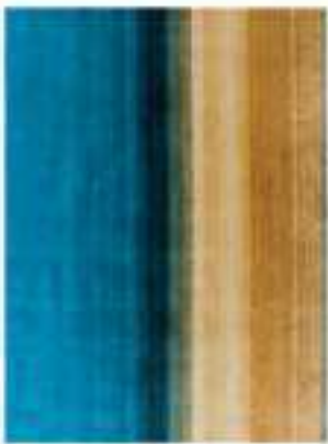
Paysages. Sebastien Cordoleani 170x240 cm / 5'7"x7'11" 200x300 cm / 6'8"x9'10"