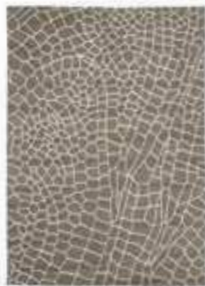
Dragonfly. Nendo 170x240 cm / 5'7"x7'11" 200x300 cm / 6'8"x9'10" Marrón. Brown.