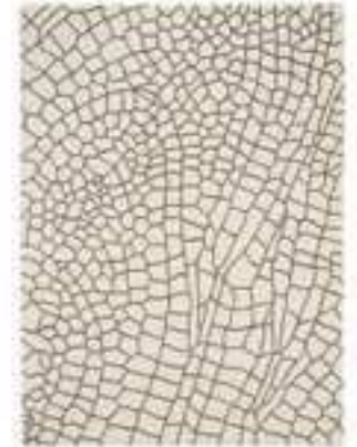
Dragonfly. Nendo 170x240 cm / 5'7"x7'11" 200x300 cm / 6'8"x9'10" Topo. Taupe.