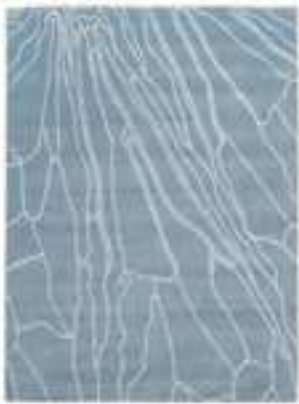
Butterfly. Nendo 170x240 cm / 5'7"x7'11" 200x300 cm / 6'8"x9'10" Azul. Blue.

Técnica de fabricación. Manufacturing technique: HAND KNOTTED.