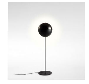
Theia P Light Source: LED SMD 700mA 8.2W 2700K CRI90 913lm