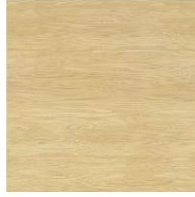
Veneered wood Natural ash

Materials, fabrics, leathers, colors and finishes are approximate and may slightly differ from actual ones. You can find the complete collection of Bonaldo fabrics and leathers on the website https://www.bonaldo.biz/