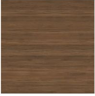
Veneered wood Walnut Canaletto