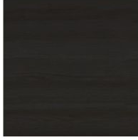
Veneered wood Coal ash