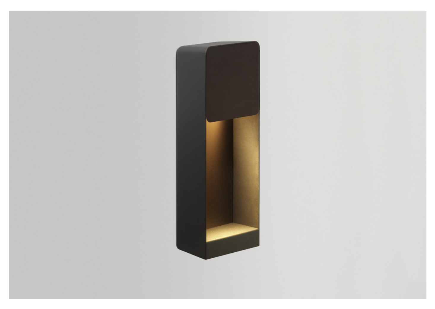
Lab A 35