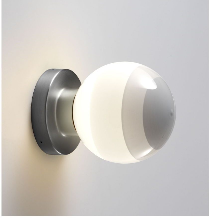
Dipping Light A1-13